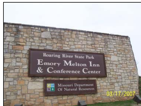
Inn & Conference Center sign on rock wall at entrance