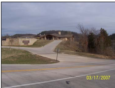
Entrance to Inn & Conference Center seen from Highway 112

Look for these visual landmarks for your left turn into the entrance of the Roaring River Inn & Conference Center: